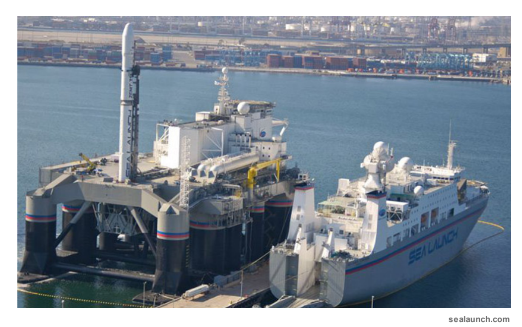
Sea Launch has ordered several Zenit-3SL rockets, which are in various states of completion, from east Ukrainian defense industry giant Yuzhmash.